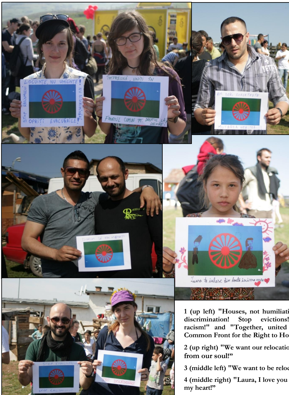
5 (above) "Stop evictions!, Stop racism!" and "Stop discrimination!"

1 (up left) "Houses, not humiliation. No discrimination! Stop evictions! Stop racism!" and "Together, united in the Common Front for the Right to Housing"