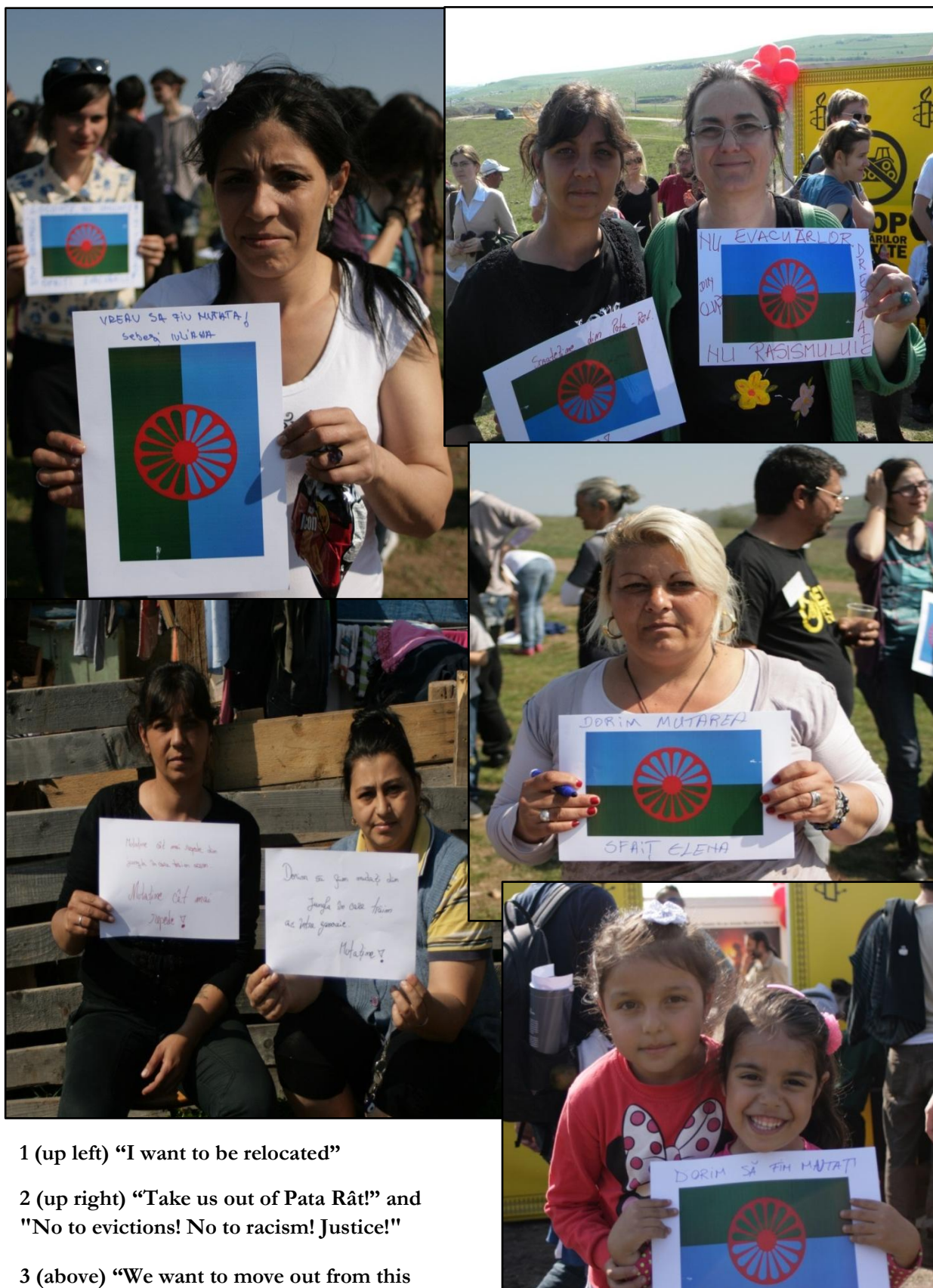
1 (up left) "I want to be relocated"